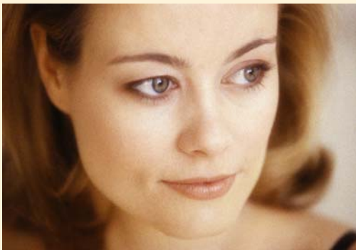
Photo Rejuvenation subdermal remodeling

Today's informed patients demand the safest, most comfortable, lowest-recovery procedures possible. The NaturaLase 1064 allows you to address those needs with new and exciting treatments.